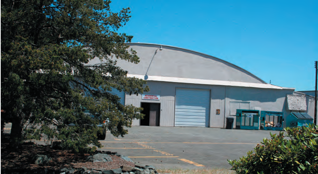
The Mueller- Harkins Hangar on the Clover Park Technical College campus as it appears today from Steilacoom Boulevard.