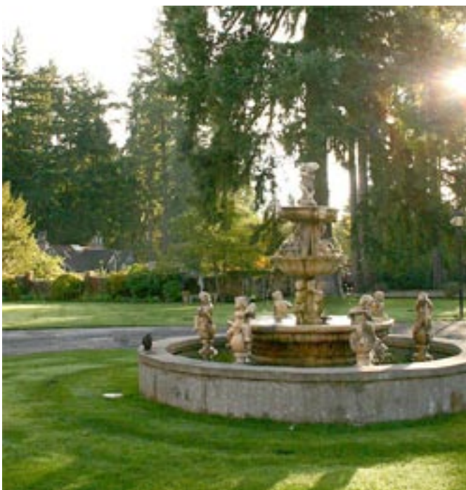
6 Thornewood Castle's "Rose Red" fountain

There's also the ornate Thornewood Castle fountain. Placed at the famous Tillicum estate on the edge of American Lake in the early 21st century, the fountain is a legacy from ABC Disney whose film crew used the castle for its made-for-TV mystery, “Rose Red”. The massive fountain appears in several scenes in that gothic horror