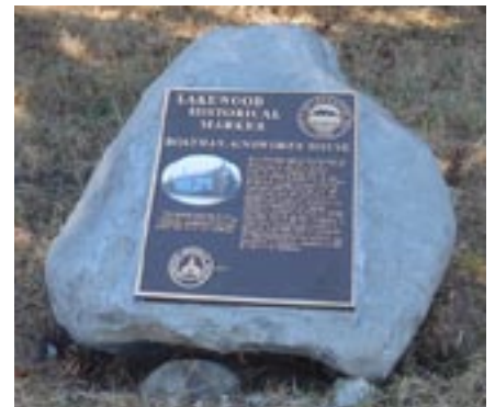
LHS marker, visible from sidewalk along 112th Street SW