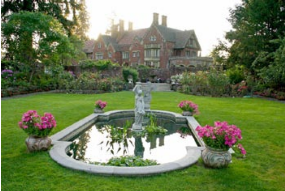
Fountain in the "Sunken Garden", Thornewood Castle.

Finally, there's a fountain on the grounds of Mt. View Memorial Park off Steilacoom Blvd.