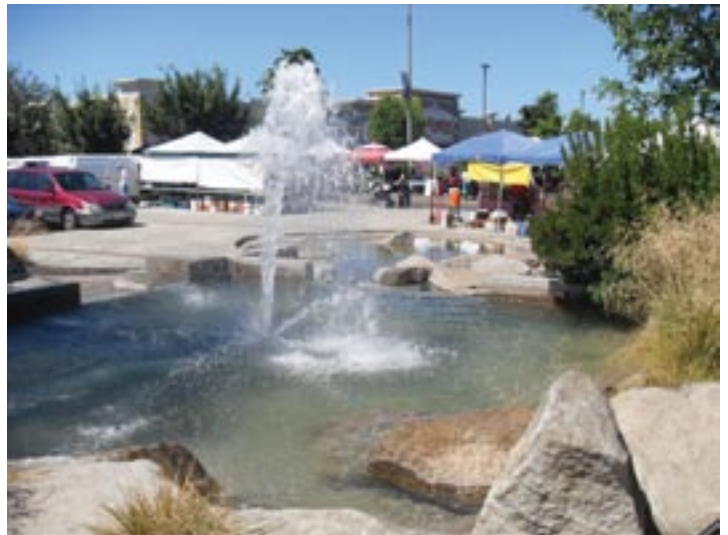
City Hall fountain, Lakewood Farmers Market in background

“Our sense of continuity and rhythm is universal in water. Even in childhood I was interested in running water, in the recycling process of water. I remember Mark Tobey talking to me about the life cycle of the universe and the fact that water moves about endlessly in its various forms, vapor, ice drops forming in the clouds to be released into the rivers. This recycling always fascinated me” (Estes). It was the essence of the Northwest itself, with its rain and its ubiquitous bodies of water.