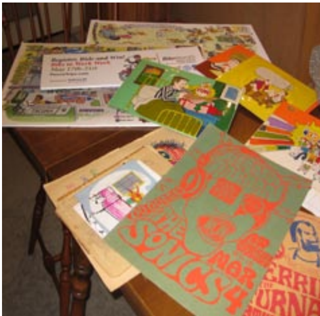
A few representative works, spanning nearly 50 years