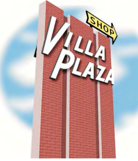
Long-time residents will have no trouble recognizing this once-familiar landmark

Before 1937 the fledgling Lakes District community lacked convenient shopping and vital services that today's residents take for granted. Fortunately, Norton Clapp, anticipating these needs, built the Lakewood Community Center in the heart of Lakewood. By the time the first building was finished in 1951 and the East building was completed in 1955, every conceivable need was met by local businesses.