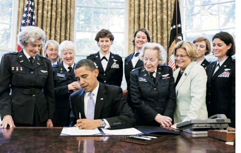
President Obama signs the bill authorizing the WASP Congressional Gold Medal, July 1, 2009.

Each of the applicants already had a pilot's license. While they were trained "the Army way," by the U.S. Army Air Force at Avenger Field in Sweetwater, Texas, the WASP was considered civil service and the women did not receive military benefits unlike their male counterparts. Because of their civilian status, they were not administratively tied to the Army Air Force and could resign at any time after completing their training, although few, if any, did.