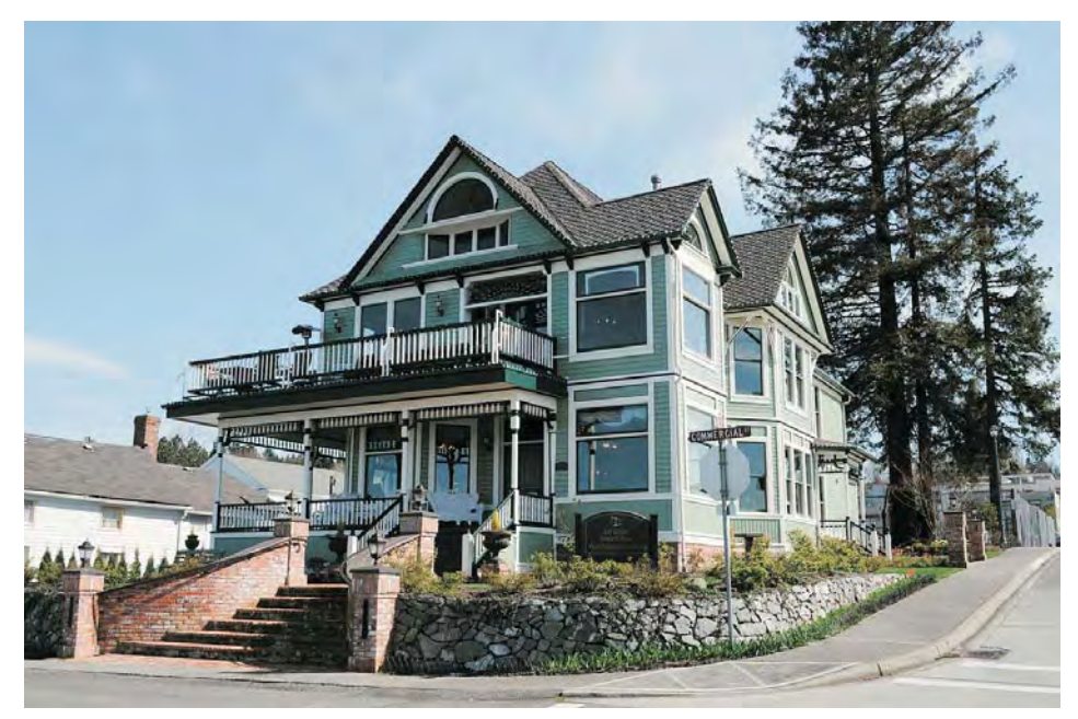
E. R. Rogers mansion: crown jewel in the Steilacoom Historic District

The story of this mansion's transformation into an elegant office is a fitting chapter in the saga of a community recognized as the oldest incorporated town