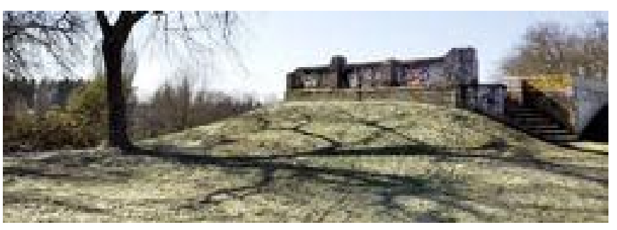
After the building was abandoned in the early 1960s, it became a youth party site and troublemakers hideout.

resident said. "Even my kids used to sneak up there."