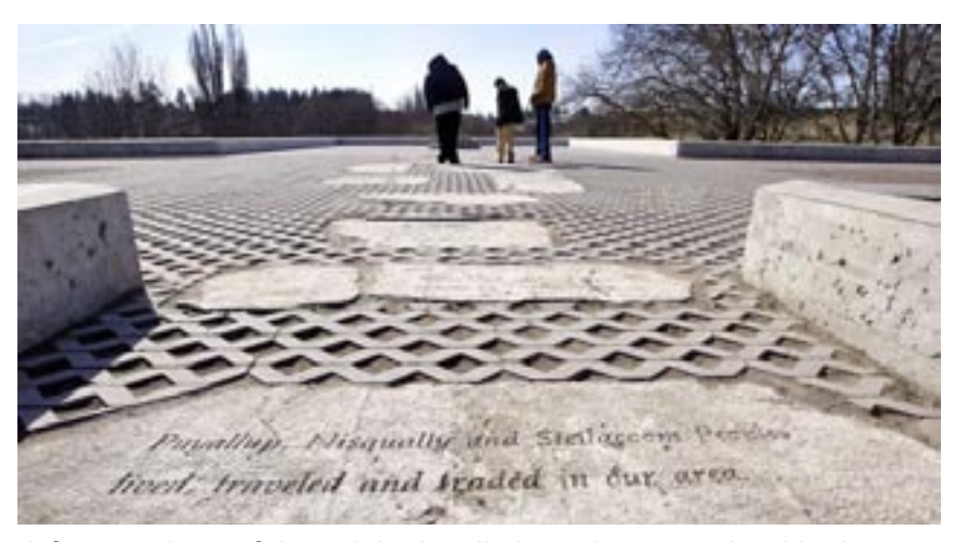
A few sections of the original walls have been retained in the memorial created on the site.