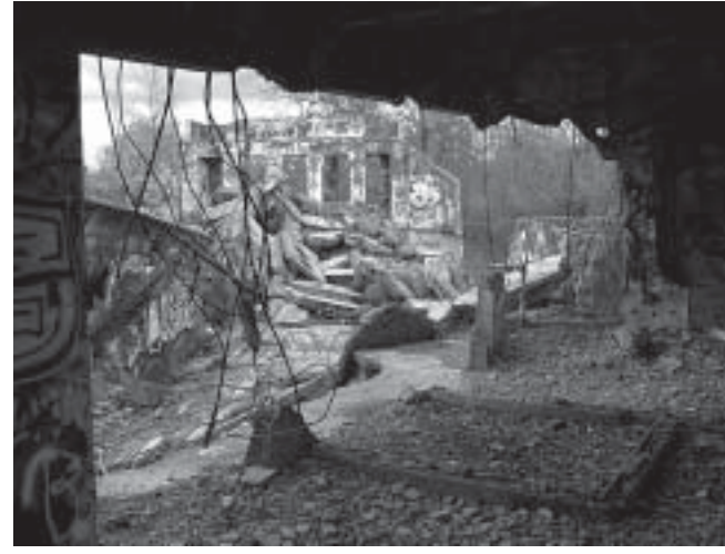
Hilltop Ward has fallen into total disuse since its days as a hospital ward and then a search and rescue training site. Though fenced in it has become a safety hazard for people cutting the fence for unauthorized access and illegal activities.

A copy of the city survey may be downloaded, if you have Microsoft Word on a computer, from http://www/ walterneary.net/ wardsurvey.doc Or if it's simpler, call Councilman