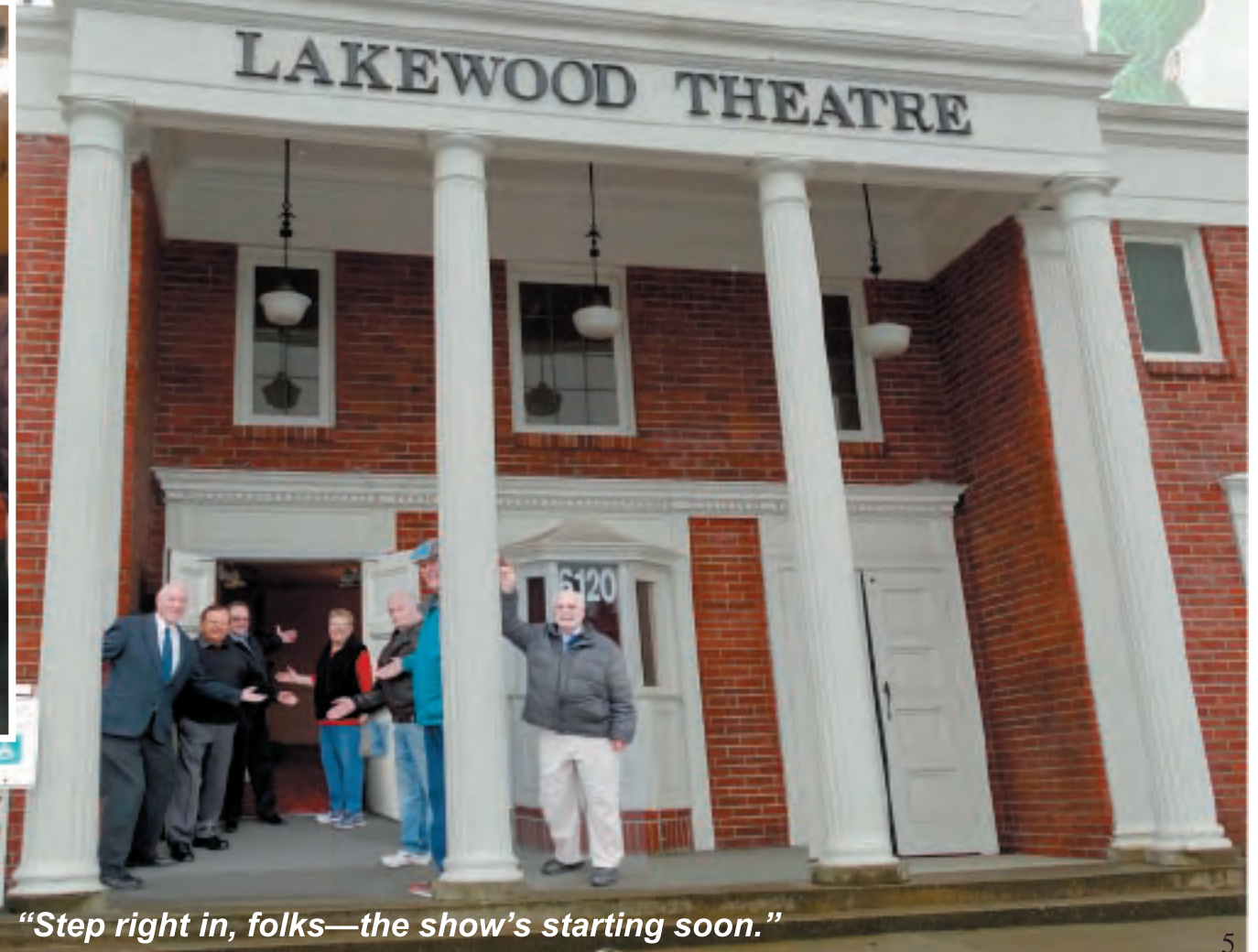
"Step right in, folks—the show's starting soon."