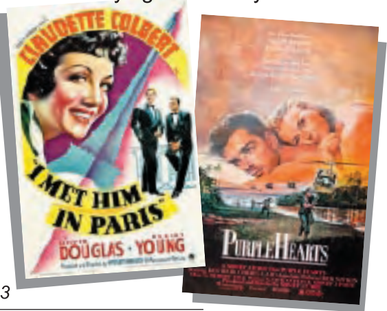
First (1937) & last (1984) movies shown at Lakewood Theater.