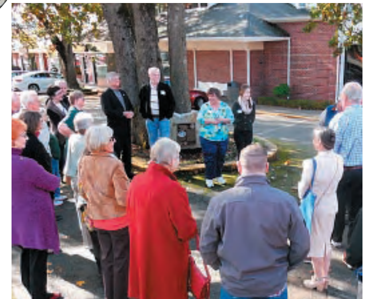
Final event celebrating the Museum's 10th anniversary in 2016—dedication of the Lakewood Colonial Center marker.

The original Colonial Center included a theater, grocery store, pharmacy, dental office and other shops. An additional section with 11 stores was added to the central core in 1951. The final complex with 14 more stores was added in 1955 on the north side of Gravelly Lake Drive. By 1962 there were 32 stores and services in the greater Lakewood Colonial Center.